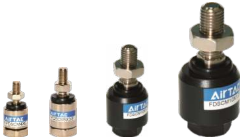
Table for floating joint and cylinder